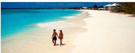
Oceanfront Property In The Bahamas

Paradise Is Mine provides investment incentives for qualified buyers wishing to purchase on the island. When seeing Rum Cay for the first time its pristine natural beauty sets it apart as a one of a kind location with the splendor and magnificence of Hawaii just off the coast of South Florida.